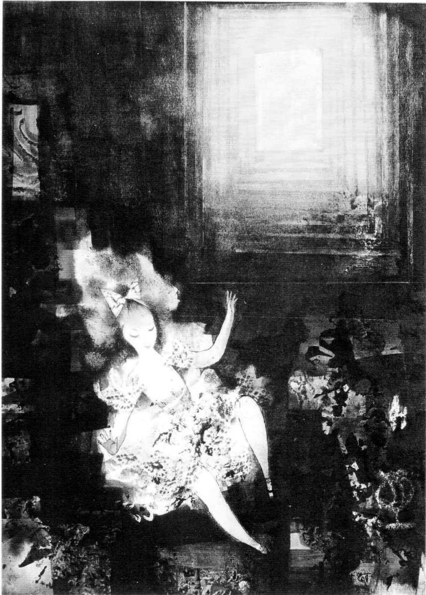
Lewis Carroll, Alice in Wonderland