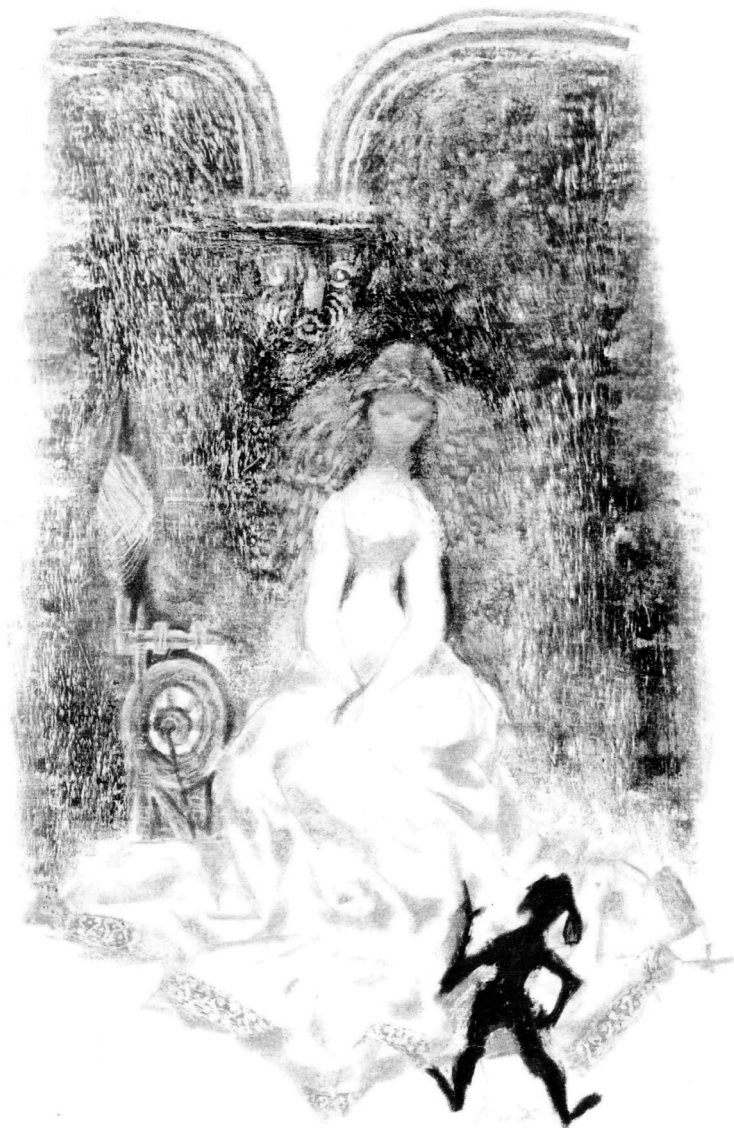
The Brothers Grimm (1942)