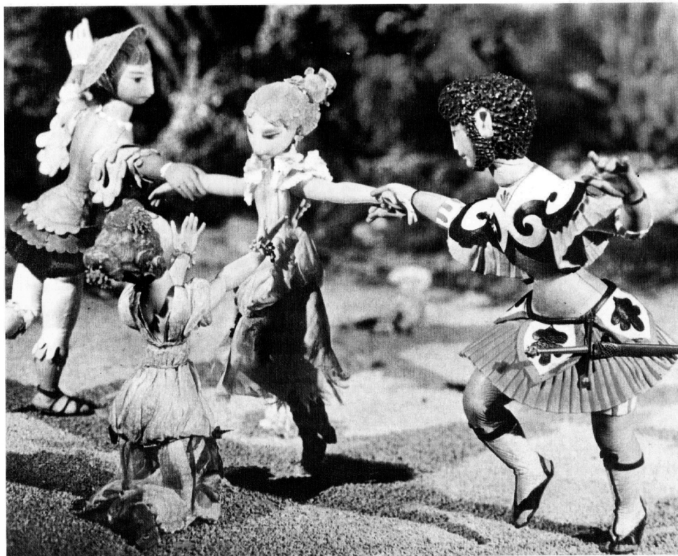
William Shakespeare, A Midsummer Night's Dream (1960)